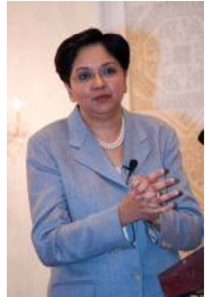
PepsiCo CEO Indra Nooyi