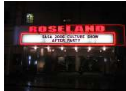
Events at prestigious locations - The Roseland in New York 2006