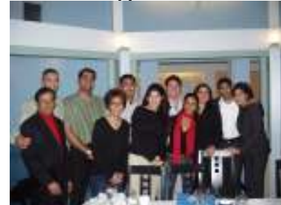
Speaker Dinner hosted by SASA