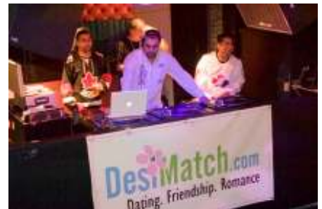
Sponsor of SASA's Kick Off Night