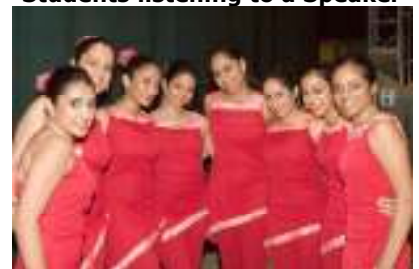
Student Team ready to compete for the SASA Championship