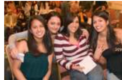
Students at a Education Session