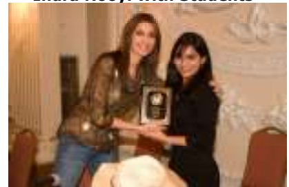
Supermodel Saira Mohan receives a "thanks"