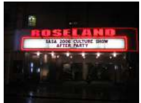
Events at prestigious locations The Roseland in New York 2006