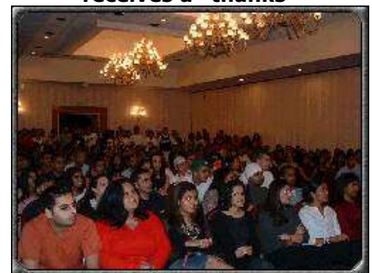
Students listening to a Speaker