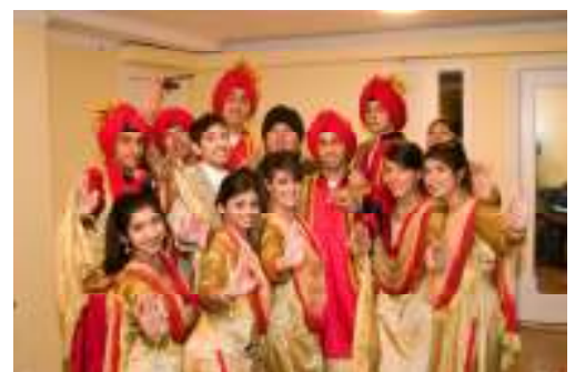
Team from California ready to prove it has what it takes at the Culture Show Dance Competition