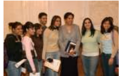
PepsiCo's New CEO Indra Nooyi with Students

SASA is celebrating its 19 th year anniversary!