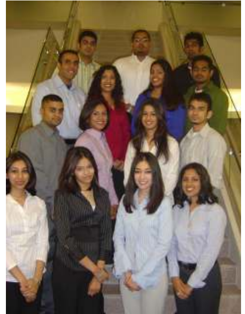
Student Leaders of tomorrow

Successful South Asians come to SASA so that they can share their stories & be HONORED in front of the future leaders!